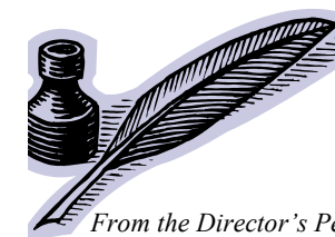
From the Director's Pen

According to the inspired Word of God, our Lord never crossed the gulf that separates the place of torment and paradise in the Hadean world. When He commended his soul into His Father's hands and breathed His last, an unimaginable Paradise of rest awaited him. Our assurance as Christians is firmly planted in the fact that after three days, Christ was resurrected and then later ascended into Heaven where He prepares a place for us (John 14:1-3). Ω